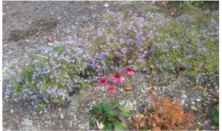
Photo: Fall colors in the gardens along the parking lot.

Soon the neighbors who park overnight in our lot will be contacted and asked to sign their vehicles up, so that we know whom to contact should a problem occur. A 'registration' system will include clear stickers for windshields, and an information card.