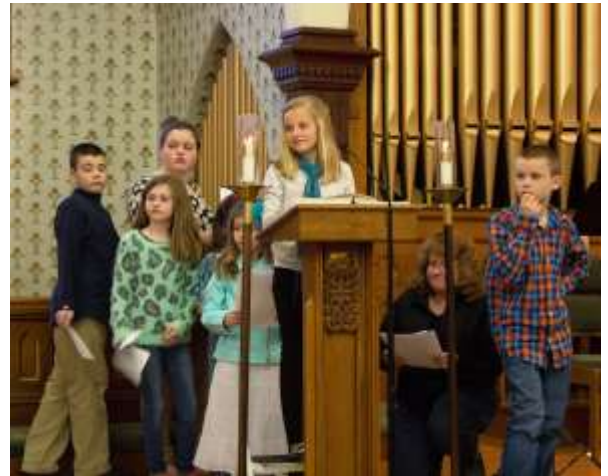
2015 Youth Led Service

Mark your calendars for Sunday, March 6th. The youth of Gethsemane have been busy planning the 10:30 service and will be conducting it that day. The Confirmation Class will be giving the sermon, the Sunday school classes will present a skit based on the parable of the Prodigal Son. There will be great music and lots of energy.