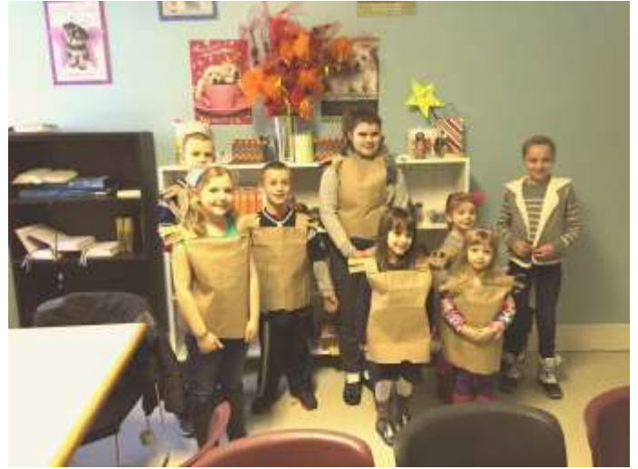
Sunday School "Centurions" from their lesson "A Roman Officer meets Jesus" Matthew 8:5-13